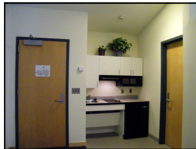
Mini Suite Kitchen